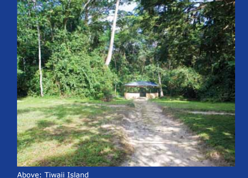
Above: Outamba Kilimi National Park