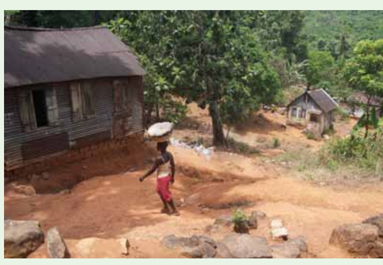
Above: Bathurst villaage. Below: Central Freetown