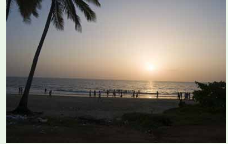
Above: Sunset at Lumley beach

Sierra Leone has some of the most un-spoilt and exotic islands in the World. Covered with green jungle and skirted by white and golden sands, their breath-taking scenery and relaxed island vibe are something special to be experienced.