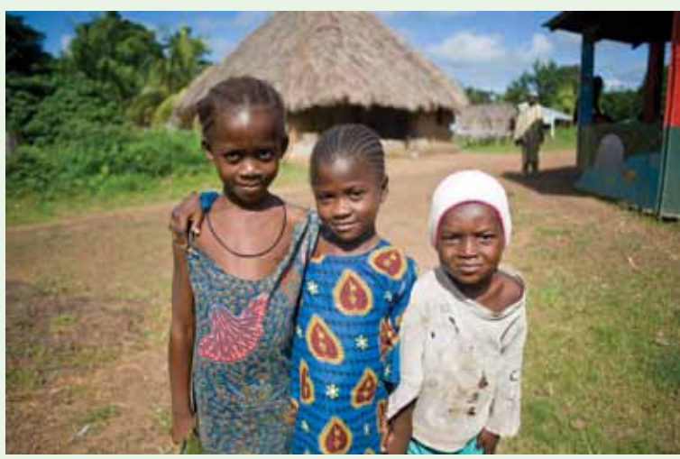
Above: Village scene. Below: Arts & crafts