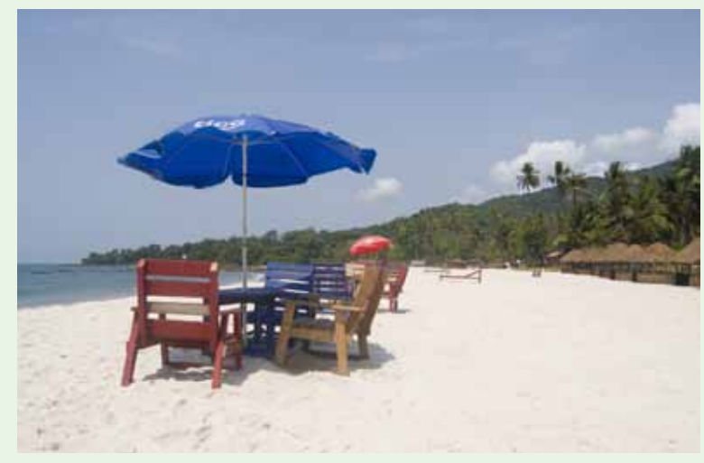
Above: River No. 2 Beach. Below: Chain fishing

Enjoy one of five chilled out beaches, take a break in one of the low-key restaurants, take a walk in the 'bush' or visit historical sites such as the Portuguese ramparts, the canons from 1813 and the church ruins. The strip of water between Ricketts and Mes Mieux is great for snorkeling. Other activities include fishing with the local fishermen, visiting a bat cave or bird watching on land or sea, where water fowl nest on a small nearby island.