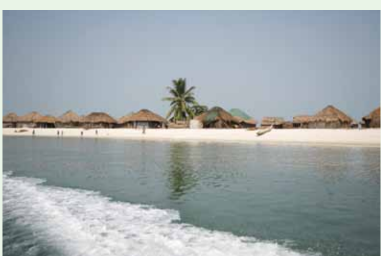
Above: Turtle Island. Below: Wara Wara mountain

Freetown is a vibrant and energetic city with colourful markets and a maze of streets and alleyways. Don't miss the original Fourah Bay College ruins (which earned Sierra Leone the title of 'the Athens of Africa'), Big Market (a crafts market), the Cotton Tree (a spectacular and iconic cotton tree in the centre of Freetown), the National Museum, and the Sierra Leone Railway Museum.