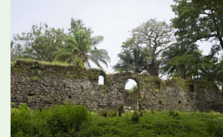
Above: Slave fort remains, Bunce Island